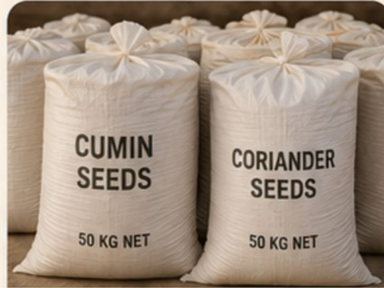
PP / Woven Bags