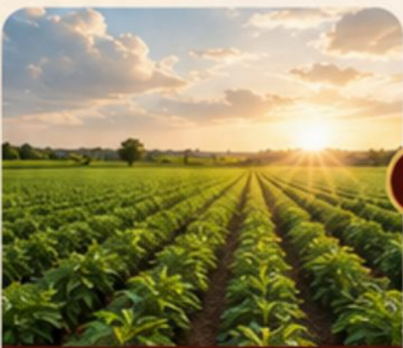
Farm / Origin