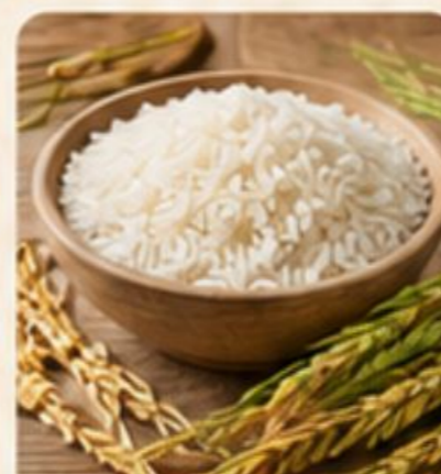
Rice & Grains