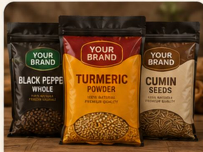
Private Label Packs