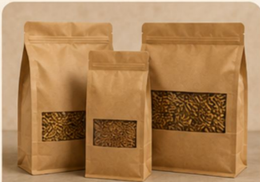
Kraft Paper Bags