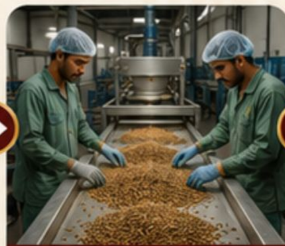
Cleaning & Sorting